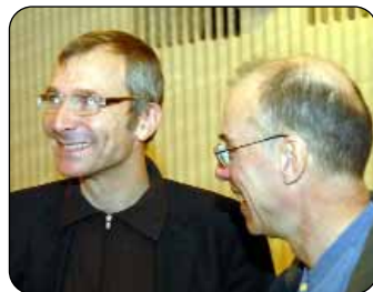
Speakers at International conference on LGBT Rights, organised by Nash Mir in Ukraine