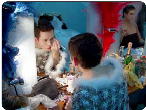
"Diva" is dressing before performing on a gay discotheque organised by Nash Mir, the first ever one in Donetsk, 2005

One of the last research studies conducted by Nash Mir in 2009 was devoted to the situation of same-sex partnership. Before that no serious effort was made to investigate social and psychological aspects of gay families in Ukraine. Thus we tried to fill this gap.