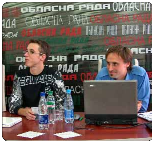
Meeting with police officers in Poltava, 2009

One such meeting was organised by representative of the Minister of Internal Affairs of Ukraine in Poltava oblast in September 2009. Representatives of Nash Mir met local police officers. "Bible is main law", said one representative of the law-enforcement division. Thus a lot educational work should be done in this direction. This work is sponsored by Open Society Institute.