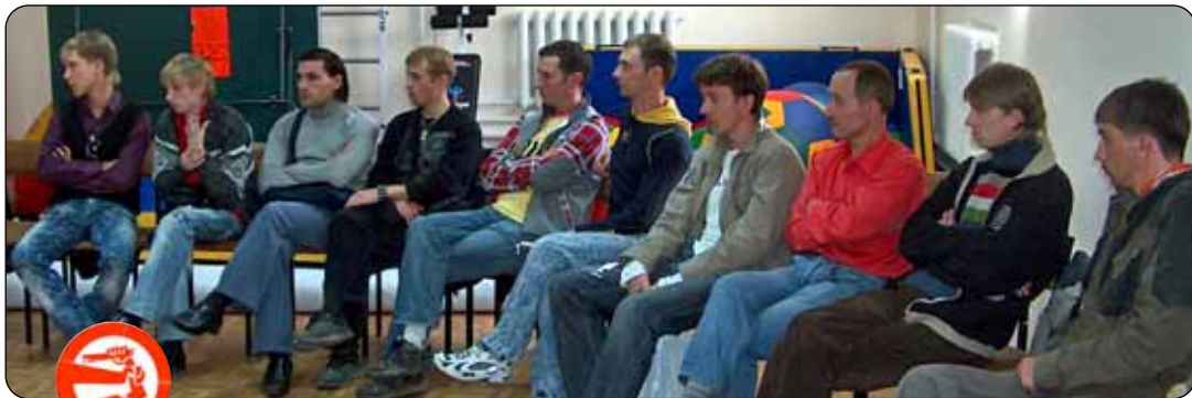
Nash Mir staff train local gay men in Vinnitsa about human rights and advocacy, 2009

Certainly we didn't let ourselves be humbled by such obvious discrimination. Nash Mir was registered at the end of 1999. But this success was made possible only as the result of a determined battle by the members of the organization. In this struggle we were supported by Amnesty International; the International Lesbian and Gay Association (ILGA); as