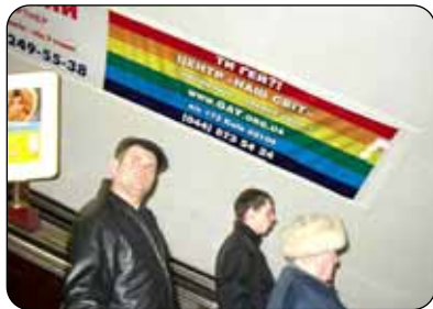
Nash Mir's advertisement in Kyiv Metro line: "Are you gay?", 2005

Mainstream politicians increasingly oppose the fundamental rights of LGBT people with intolerant language, and their statements go unchallenged by persons in authority. Some of them continue to make highly intolerant homophobic statements. Here is just one example. In November, 2006 Chairman of the Committee on Human Rights, communist Leonid Grach stated, that "homosexuality is an anomaly, which is caused by the amorality and the depravity of man" . Later he continued to speak in public in that spirit: "Me and my colleagues in the Parliament have to protect the society from infringement upon morality, to prevent penetration into consciousness and souls of people of any age the idea that the state is on the side of people who sow debauchery, promote dissoluteness, sexual permissiveness, bringing abomination of corruption of morals into society" . In the opinion of this MP, "the state must protect the society from evil, from violence, including such evil as homosexuality, lesbianism and such" . Unfortunately despite calls from