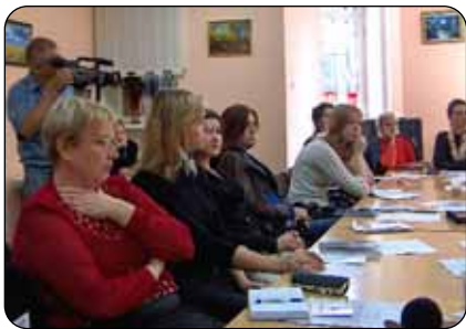
Seminars with doctors, psychologists and teachers -- within the framework of Network Project. Vinnitsa, 2009

In this dramatic background Nash Mir in cooperation with the German organization Connect Plus and three Ukrainian partners in 2009 launched Network initiative. The problem which the project attempts to address can be summed up as follows: MSM are frequently reluctant to reveal their sexual orientation to medical personnel, psychologists and other specialists because they fear maltreatment due to intolerant attitudes towards homosexuals. As a result, MSM cannot receive qualified aid -- or such prospective patients/clients fail to seek access to aid altogether.