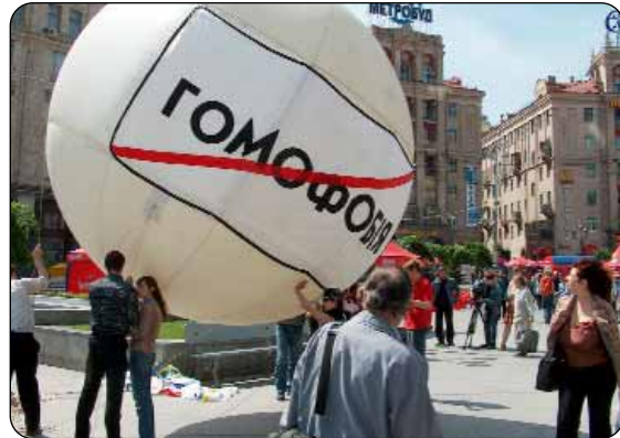
Nash Mir launching balloon against homophobia in the International Day Against Homophobia. Main square of Kyiv, 2005