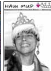
Nash Mir's publications