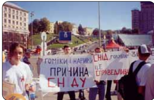
"Fagots & drug addicts are the cause of AIDS", "AIDS is fair for gays", and "Perverts get out of Ukraine". Anti-gay picket at main square of Kyiv, 2003

In these social conditions LGBT people often face discrimination on the basis of sexual orientation and other hate motivated crimes. In 2005, Nash Mir questioned more than 900 gay people across Ukraine in an attempt to ascertain statistical information and identify the most serious problems facing homosexuals. 54.4% of respondents reported acts of prejudice and discrimination against them on the basis of their sexual orientation. Among those respondents who do not try to conceal their sexual orientation the number reporting discrimination and abuse was much higher: more than 76%. Problems of discrimination and abuse were reported in the work place, in social and educational institutions and with representatives of law enforcement bodies. Most respondents noted problems of discrimination in