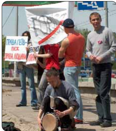
Picket organised by Nash Mir in support of a student who was dismissed from University because of his homosexuality. Kyiv, 2005

Indeed, it would be surprising if such statements did not result in even higher levels of violence and discrimination.